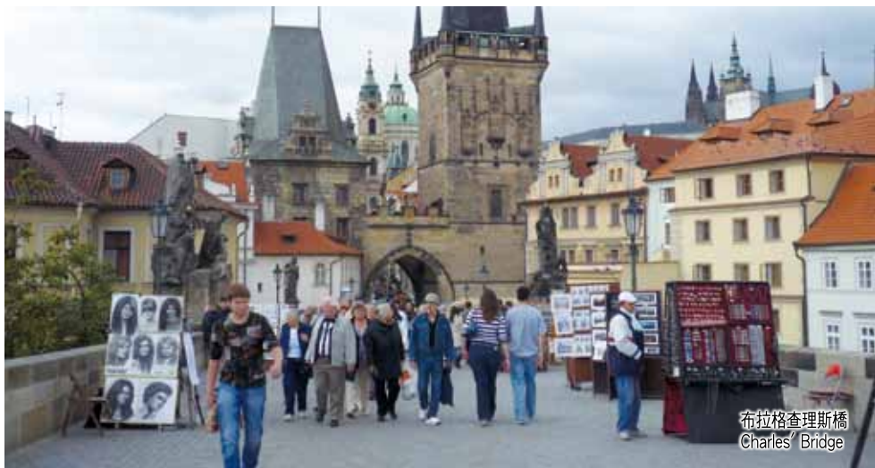
布拉格查理斯橋 Charles Bridge

住宿：Berlin Hotel 或同級 (早、午餐) Coach to Dresden. Highlights of the tour today include the Zwinger Palace, Semper Opera, Saxon Wall and 18th century Cathedral. Typical German knuckle lunch will be served. In the afternoon, proceed to Berlin to visit Wilhelm - memorial church which was severely devastated during World War II. (B/L)